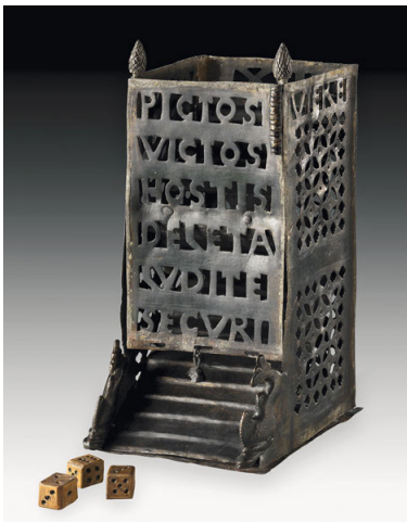
Roman dice tower found in Germany. "The Picts are beaten, then enemy annihilated, let us play without a care."

Shortlisted for the EAA Book Prize and the Current Archaeology Book of the Year Award