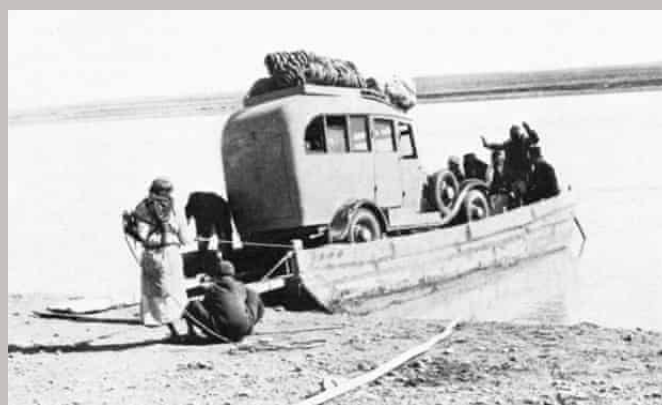
The 'Queen Mary' on the Euphrates during Christie's Syrian trip.

https://www.theguardian.com/books/2015/may/20/agatha-christie-syrian-memoir-to-be-republished